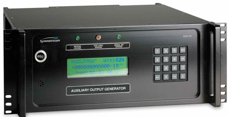
AOG-110 Auxiliary Output Generator

The output frequency is controlled by directly offsetting a phase accumulator (synthesizer) in the PLL chain. The maximum synthesized fractional frequency range is \pm 1E-7 , with a fractional resolution of 1E-19 . By altering the frequency output over a precise time interval, output phase control is achieved. Typically, the user defines the desired phase offset and time interval within which the offset is made. Once set, the AOG-110 automatically implements the appropriate frequency offset and precise time interval. Direct control over both frequency and time interval is available.